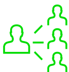
Payroll management and processing